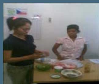
ADRA has given Spa and Salon training.