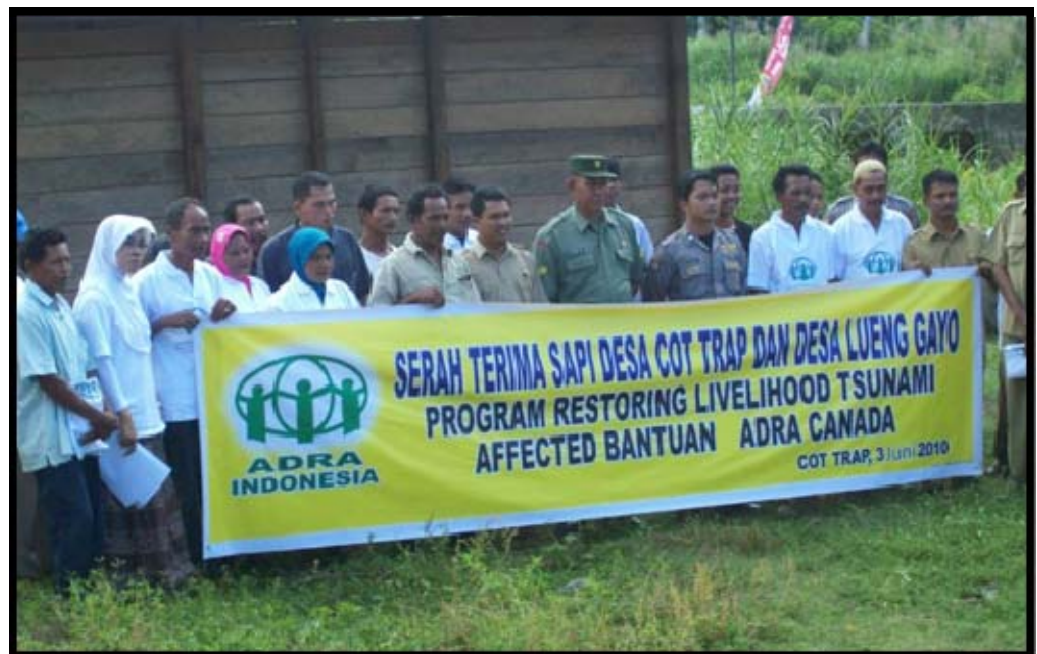
ADRA provides cattle aid to beneficiaries.