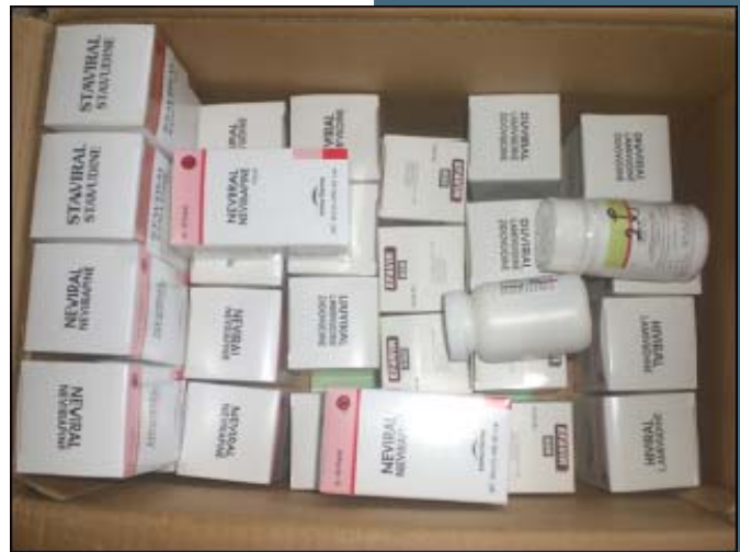
ARV drugs are ready to distribute to VCT clinic.