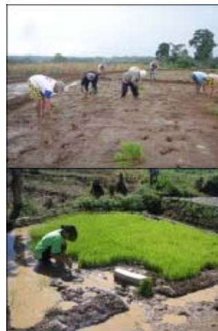
Last seedling at Sumber Baru village.

providing organic fertilizers, preparing the land area, seeding and weeding, etc. It is our hopes that farmers could learn many things about SRI and Organic Paddy Plantation through this demo site program, and also could learn how to increase yields.