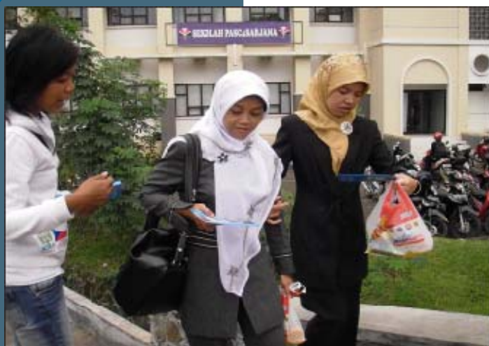
Brochure distribution to promote Pangandaran products.