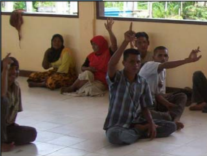
Beneficiaries participated in the formation of management temporary group.