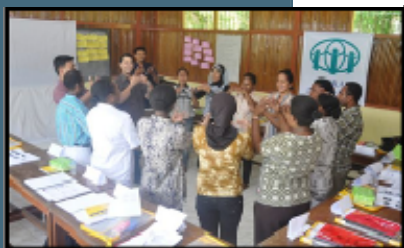
Engizger in Case Manager Class.

4 puskesmas health workers from Teminabuan sub district, 6 puskesmas health workers from Moswaren sub district, 4 puskesmas health workers from Wayer sub district, 3 puskesmas health workers from Seremuk sub district. 6 midwives, 17 nurses and 2 doctors and 2 head of puskesmas. 5 men and 22 women.