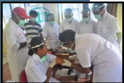
Practice in patient blood sample to test in laboratory equipment.

laboratory staff of Wayer Health Center, a laboratory staff of Seremuk Health Center, a laboratory staff of the Foundation of Saint Augustine Sorong and 3 staff of Health Dept of South Sorong. The training period and material is based on the standards that set by the Department of Health of the Republic of Indonesia and WHO. (by Reyki Gantare - Project Coordinator )