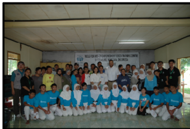
ADRA Team, WIUM Envoy, OISCA Team and training participants photographed together after handed over ceremony finished.