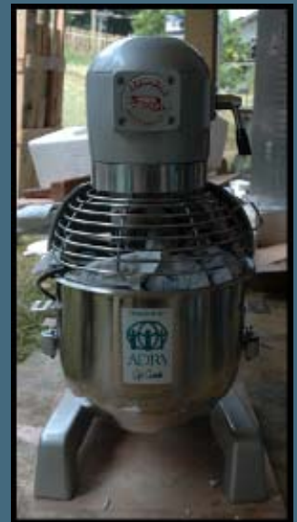
One unit mixer to support small business in OISCA training center.