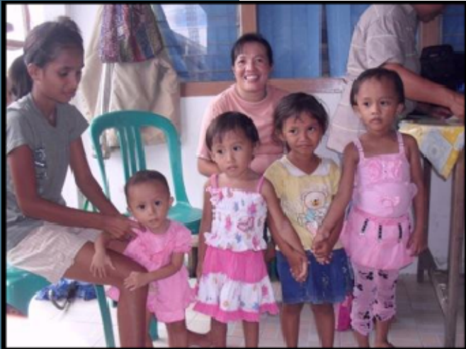
Children in the nutrient post.