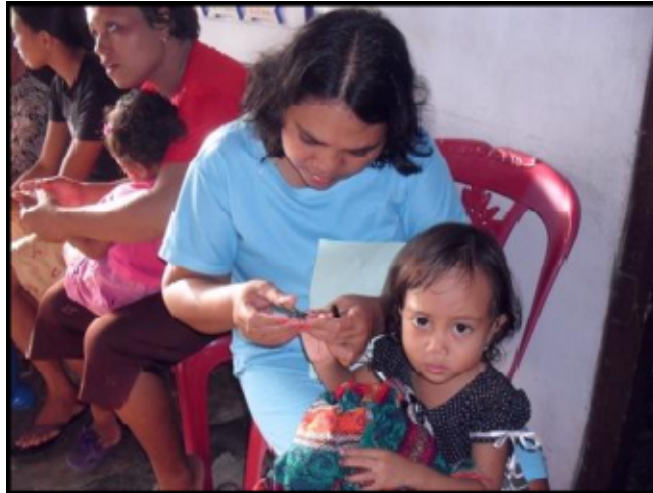
Activities in the nutrient post.

Because in this approach, the contribution from community and mothers of children who have poor nutrition is needed, this is what makes this activity a bit hard to accept, especially if we are explain it in a wrong way, this activity can be failed. But this is become a challenge for us and this is a enjoyable if we can make it. Below are the stages that must be done in starting the Nutrient Post with PDI approach: PDI Training for Kader Posyandu performed for 9-10 days. Conducting the training for 9-10 days for Kader and community leader is not easy work but it must be done. After we see the contents of the training so we share it, because the