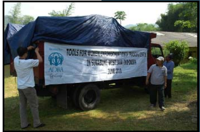
The truck just arrived in Sukabumi and ADRA Team immediately unloaded the aid.