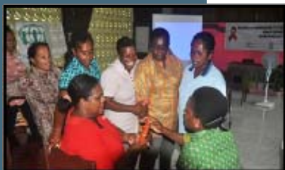
Practice how to use condom with the right and save way, one of the session in counsellor class.