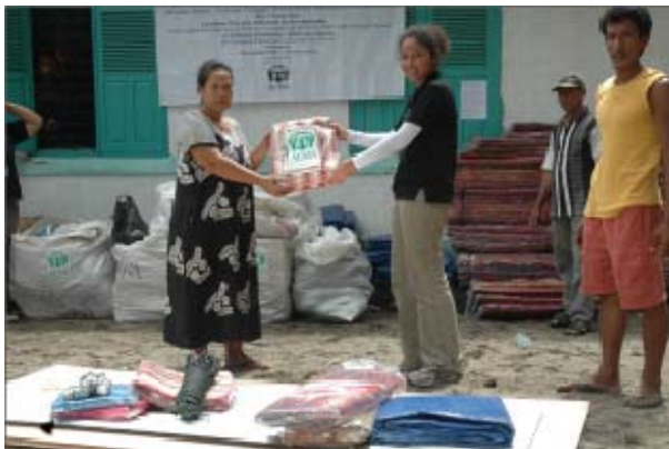
ADRA handed over non food items and transitional shelter kits to beneficiaries in Sungai Limau sub district.