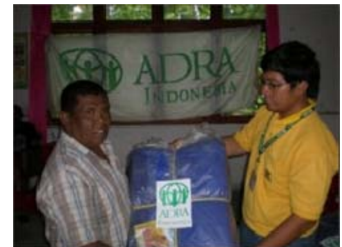
ADRA handed over tarps to one of the beneficiaries in Sungai Geringging sub district.