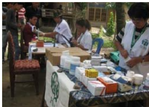
Medical team from Lampung Adventist Hospital collaborated with ADRA to give medical treatment in Sungai Geringging sub district.