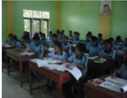
Students studied seriously.

F ull second storey main building was finally finished on May 2009 after 5 months of dedicated work. The phase 2 project has provided 4 classrooms and 1 computer lab on second floor, water tower and other finishing works.