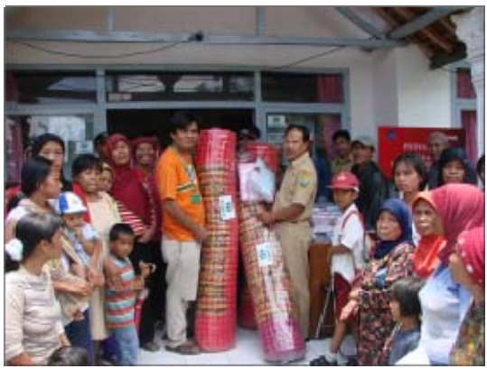
ADRA handed over aid to the beneficiaries.