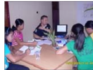
ADRA has trained health workers