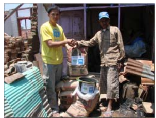
ADRA handed over aid to the beneficiaries.

On September 2, 2009 at 02.55pm a 7.3 Richter Scale (RS) earthquake struck Tasikmalaya District, West Java Province. The National Disaster Management Agency (BNPB) reported 75 deaths in 13 districts in West Java and one district in Central Java. ADRA Indonesia provided 1,000 packages of non food items such as bedding kits materials: mattresses and blankets, construction materials: cements, buckets, nails, hammers, cement scoop.