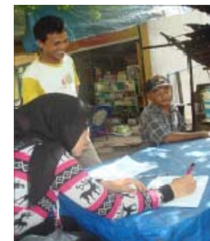
ADRA has conducted baseline survey in Lueng Gayo village.

head of household to take care of family needs, and empowerment of women. The project will utilize different approaches such as livelihood trainings, establishing cow banks & chickens pass on program. The livelihood trainings will focus on chicken & cattle raising, organic farming using animal manure, production of biogas using the animal manure or an alternative source of energy, different food production using animal products, business management, and environmental hygiene.