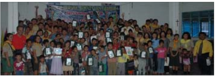
Children were happy with bathing kits package from ADRA.

A DRRA has assisted 107 orphanage children (4 months to 17 years old) such as provide drilling well, training on vocational skill like English and Computer, bedding and dining facilities, training on health education, bathing kits, fix mosquito net on the dormitory rooms, working together with master guide members to cleans their dormitory and toilet area, provision food through planting vegetables on the back yard of orphanage house.