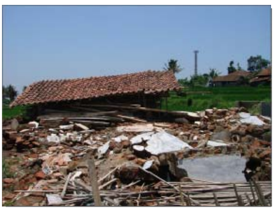
Broken houses in Tasikmalaya.

Donor: UN OCHA (USD 58,000), ADRA International (USD 10,000), ADRA ARO (USD 5,000), WIUM (USD 5,000) Fund: USD 78,000 Timeframe: September 2009 - October 2009 Location: Tasikmalaya, West Jawa - Indonesia Beneficiaries: 1,000 households Project Team: Jelome Selda (Proposal Writing), Richard Simbolon (Field Surveyor), Munson Naibaho (Logistician), Ralfie Maringka (Purchasing)