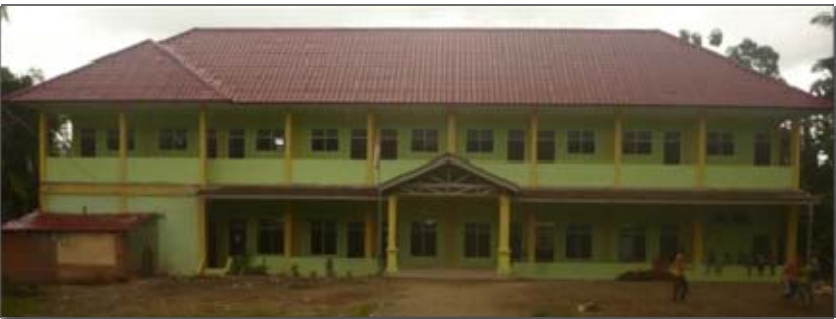
The completed Nias School Project Phase 1 and Phase 2