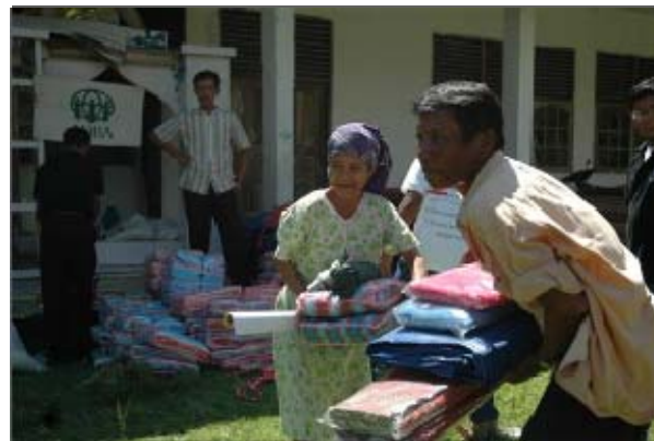
A happy couple bring their "ADRA aid package" home.