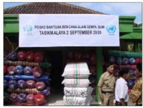
Command Post (Posko) as a center of distribution.