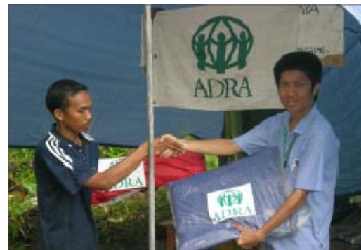
ADRA handed over tents & tarps to beneficiaries in Sungai Geringging sub district.