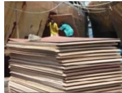
Plywoods has unloading from the ship.

ADRA has distributed temporary shelter kits to 150 badly affected households the temporary shelter kits are composed of (6 sheets of plywood, 6 sheets of zinc, 1 sheet of tarpauline, 1 kg of rope, 1 kg of nail for plywood, and 1 kg of nail for the zinc).