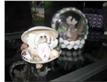
Handicrafts have been made.

It has given a better opportunity for them to run their business with ADRA's loan and saving at group.