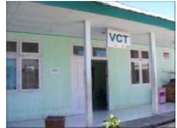
VCT centre at Puskesmas Teminambuan district.