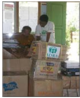
ADRA delivered educational school to elementary school in Sungai Limau.

Japan Platform through ADRA Japan and ADRA Indonesia had conducted Education Kit Aid project in Sungai Limau and Sungai Geringing sub districts, Padang Pariaman district, West Sumatera. ADRA has donated 493 unit student chair, 293 unit student desk, 59 unit teacher desk, 140 unit shelf, 125 unit whiteboard, education kits and physical education kits to 31 schools in these two sub district. The teachers had highly appreciated the project because it has given significant change to their schools. The student very happy specially when they learned that each one of them will get books and stationary. Hope has sprung in the hearts of teachers and students because of the aid to return their school activities into normal.