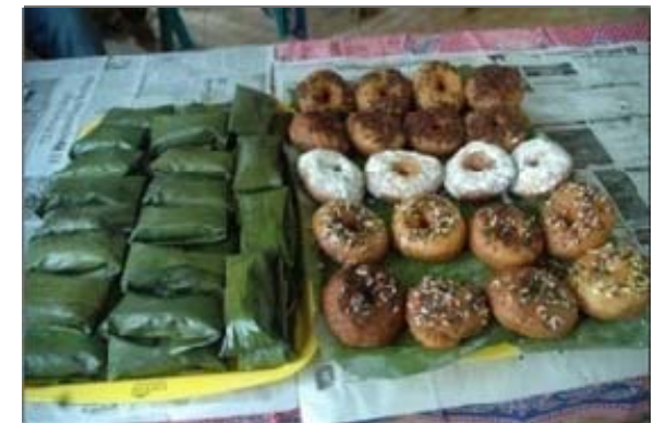
Finished products: Donuts and Naga Sari

T his project comprise a small number of beneficiaries, a total of 25 individuals living in the dumping areas of Medan. ADRA provides loan (US$ 50 – 100) and vocational trainings. It's not all about giving small loan but it focuses on how the beneficiaries, through the existence of ADRA, could get some valuable knowledge and additional skills which could help them improve quality of life.