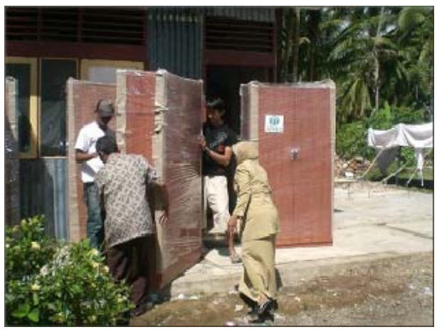
Elementary school in Sungai Limau received school furniture from ADRA.