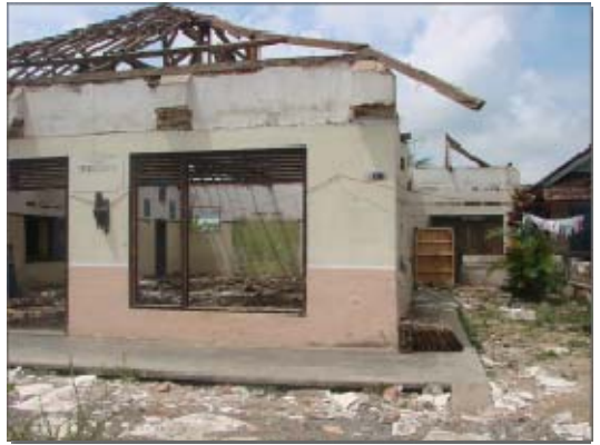
Broken houses in Tasikmalaya.