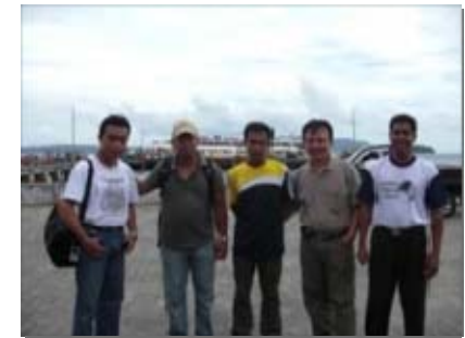
ADRA team on ground to distribute aid.