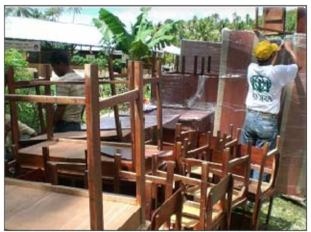
Elementary school in Sungai Limau received school furniture from ADRA.