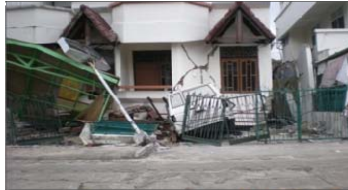
Broken houses in Padang city.

ADRA focused on 3 heavily damaged areas, which were: Kelurahan Sungai Sapih, Kelurahan Kurao Pagang and Kelurahan Sungai Geringging.