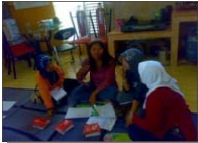
Vocational training - Handicraft producers are discussion about their products.