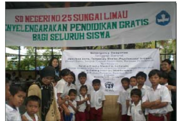
ADRA give psychosocial support to the elementary students in Sungai Limau sub district.