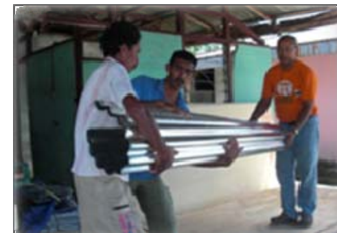
ADRA has handed over temporary shelter kits to beneficiaries.