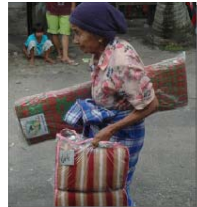
An old lady was happily bring home ADRA's aid.

On September 30, 2009 at 05:16pm a powerful earthquake measuring 7.6 on the Richter scale struck the western Sumatera coast of Indonesia. Many homes, commercial and government buildings including schools and clinics were destroyed during the quake. Other structures were significantly impacted and sustained enough damage to compromise their structural integrity to a dangerous degree. Approximately 1,250,000 people have been affected through the total or partial loss of their homes and livelihoods. Over 1,000 people lost their lives in these structures during and immediately following the earthquake. Many others are lost or have been displaced due to the collapse of their homes. The project has contributed to address and alleviate the sufferings of 500 families in Sungai Limau, Padang Pariaman through provision of temporary shelter materials, bedding kits and has helped 668 students and few teachers the same area among the 6 different elementary schools through psychosocial support.