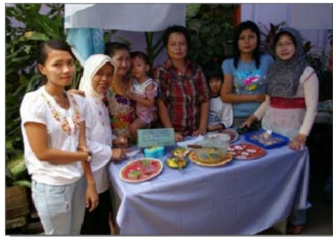
This is one of the groups, Flamboyan Group, who participated in the food bazaar organized by ADRA last April 2009.

This project had run for six years and helped hundreds of women to get a better life with their families. SED has entered the phasing out period in June 2009. Thank you ADRA Australia for you support and partnership.