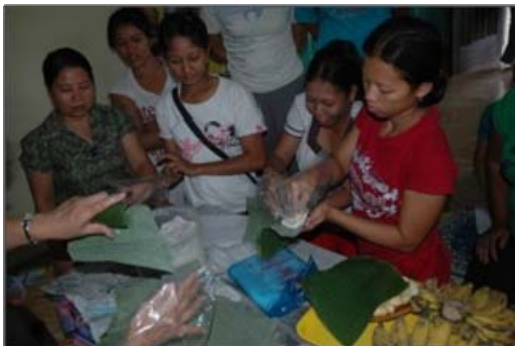
Training in making donuts.

Donor: ADRA Netherlands Fund: EUR 4,000 Timeframe: January 2009 - January 2010 Location: Medan, North Sumatera - Indonesia Beneficiaries: 25 Women Project Team: Ellen Pandia (Project Coordinator), Damres Sigalingging (Field Officer)