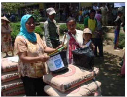
ADRA has distributed aid to one of the beneficiaries.