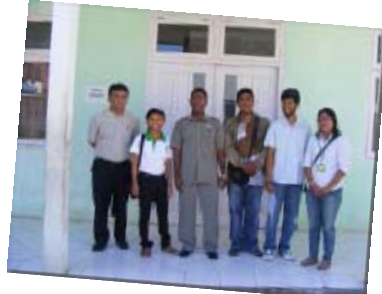
Evaluator with ADRA team and the Head of Puskesmas Teminabuan District.

ADRA has taught 1,004 community members to raise awareness about HIV & AIDS prevention. Aside from that, ADRA has distributed 1,102 IEC (Information, Education & Communication materials) and 483 pieces of condoms. ADRA has worked closely with the government to establish voluntary counseling and testing center.