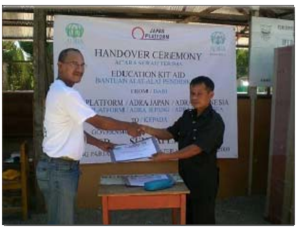
ADRA handed over aid to one of the principals of elementary school in Sungai Limau sub district.