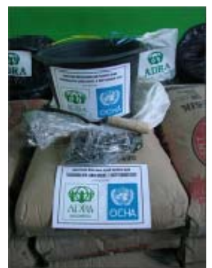
The shelter kits item.