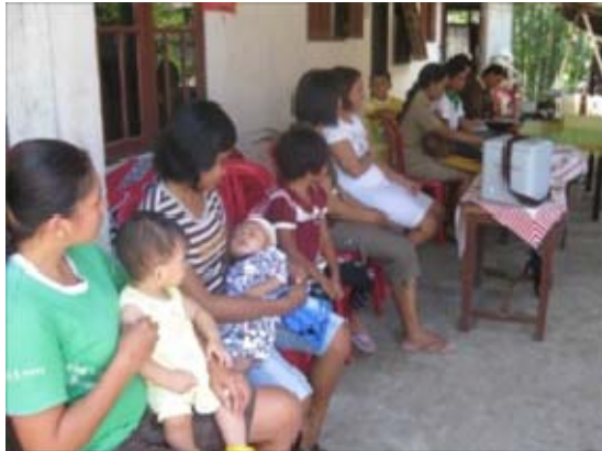
Mothers with their babies are waiting for their turn for the health check up.