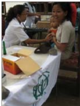
A doctor diagnosed a child in Sungai Geringging sub district.

ADRA has helped 1.000 household of heavily damaged houses in Kelurahan Sungai Sapih, 1.000 household of heavily damaged houses in Kelurahan Kurou Pagang, and 3.758 households with heavily damaged houses in Kecamatan Sungai Geringging. With these donations, ADRA has provided what the community needs in time of crisis.