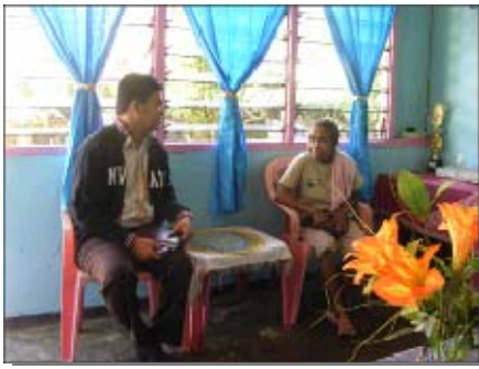
Evaluator interviewed another traditional healer in Teminabuan District.

Now, she has knowledge related to these issues, and she active spreading the information to general population in Teminabuan, South Sorong, West Papua.